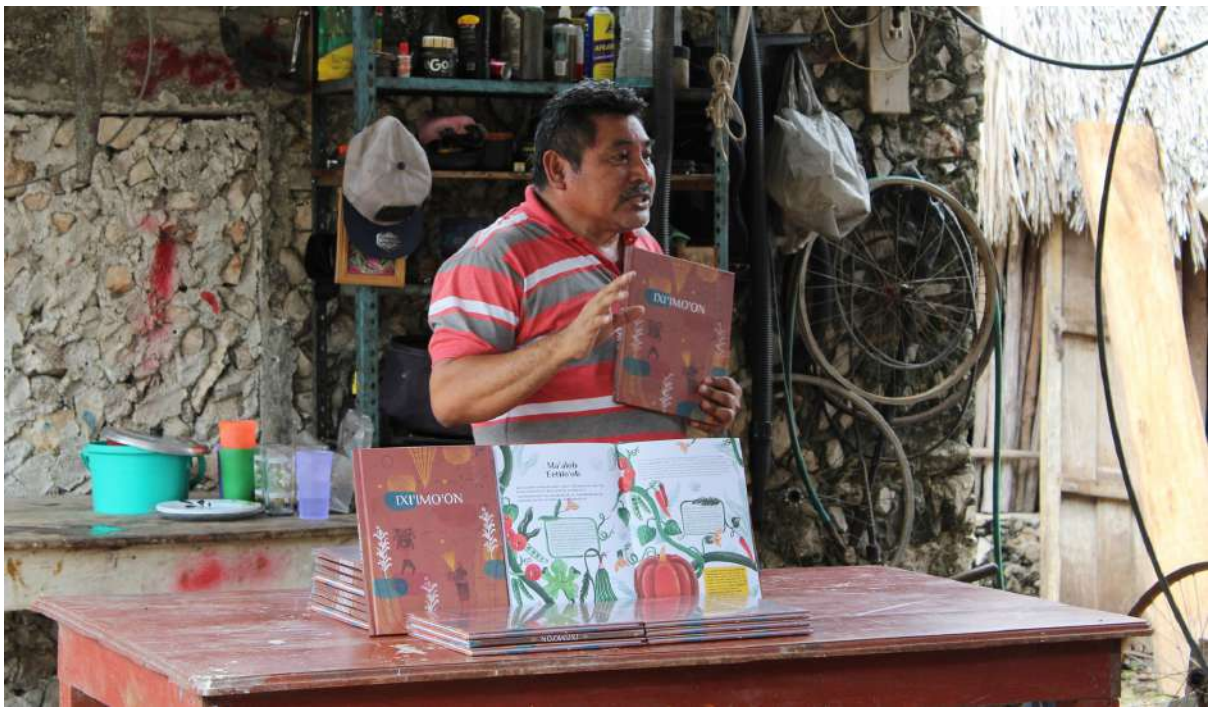
We Are Maize : Book presentation in the Mayan version at Xkalakdzonot, Yucatán

The publication We Are Maize has been distributed among 47 civil organizations and leaders of indigenous peoples throughout Mexico; speakers of Náhuatl, Isthmus-region Zapotec, Peninsular Mayan and Spanish can now read the book. Based on said dissemination, a network of organizations within different areas of Mexico has been established, considering their common goals such as food sovereignty, the preservation and dignity of native cultures, their knowledge and their link with the Earth.