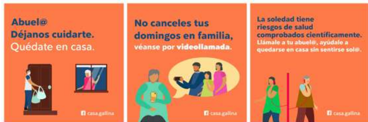
Mutual Support Network Campaign: Abuel@, It's Our Turn to Take Care of You