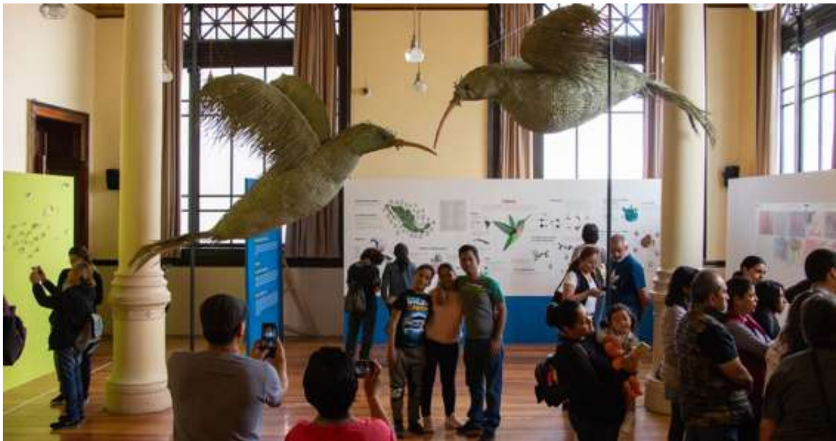
Exhibition Hummingbirds / huitziltin/ ts'unu'uno'ob at the Geology Museum

During the first few months of 2020, Casa Gallina was able to keep to its scheduled program focused on the strategic theme Biocultural Diversity , a platform that seeks to encourage critical action and reflection on the impact of human behavior on the preexisting balances of natural ecosystems; it is implemented with the Santa María la Ribera community and in other territories where the narratives developed by the Casa Gallina team circulate.