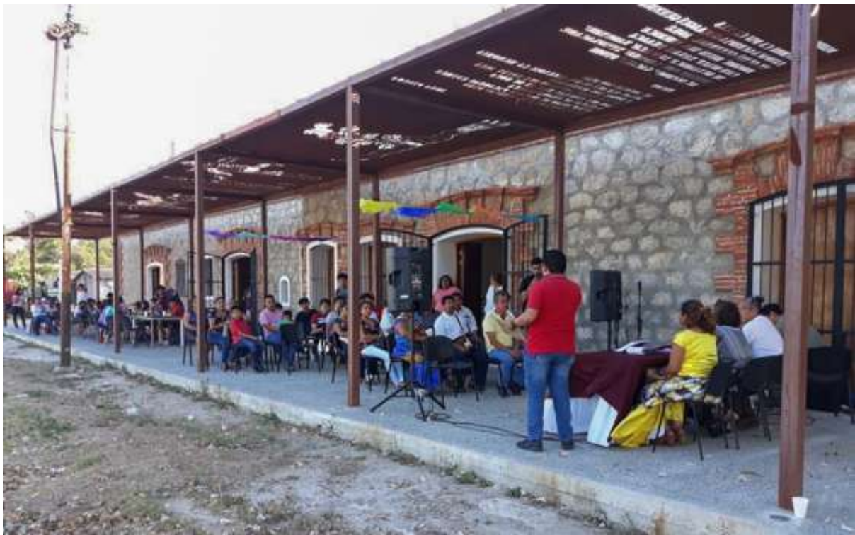
We Are Maize : Book presentation in the Zapotec version at the José F. Gómez library, Juchitán de Zaragoza, Oaxaca