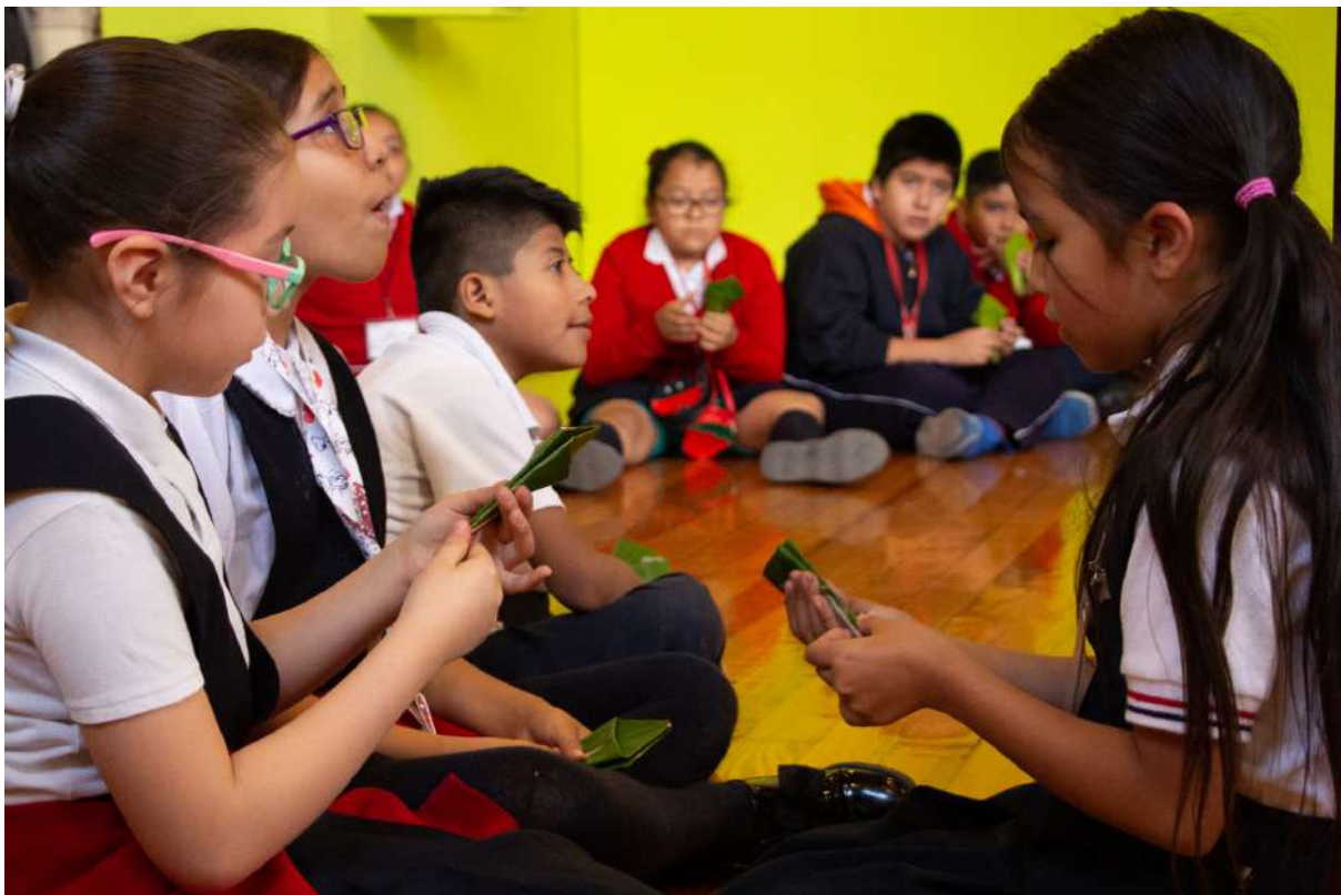
School Visit to Hummingbirds / huitziltin/ ts'unu'uno'ob exhibition at the Geology Museum.