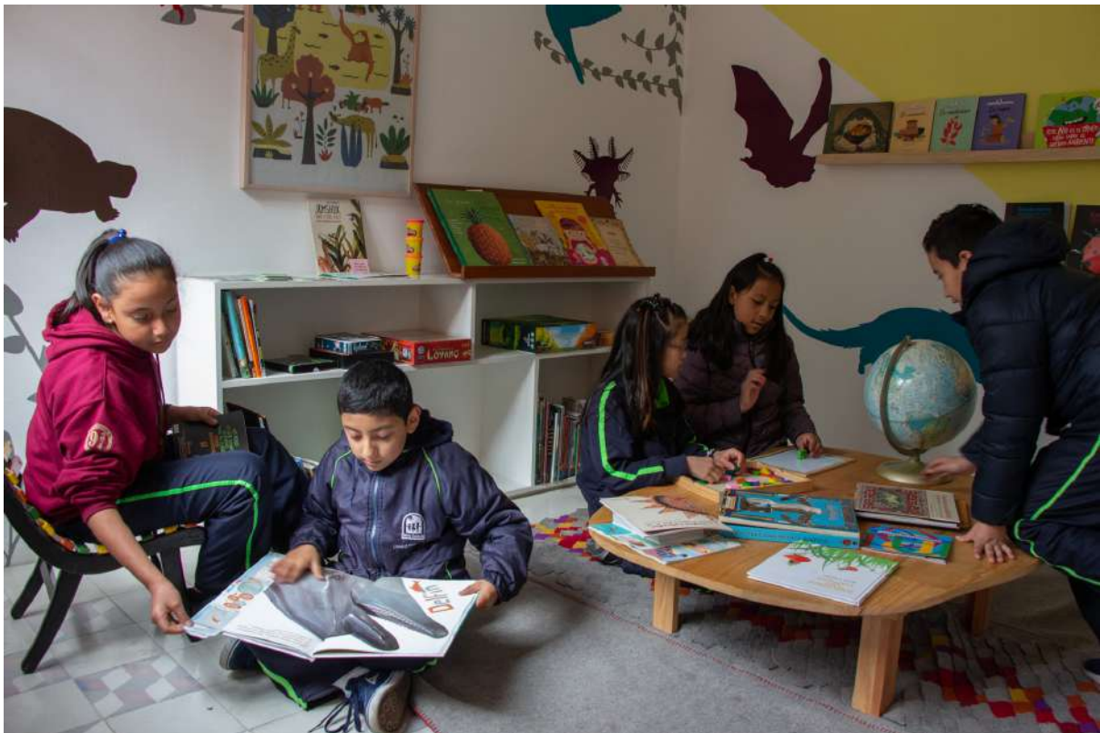
Casa Gallina new children's library El nido (The Nest)