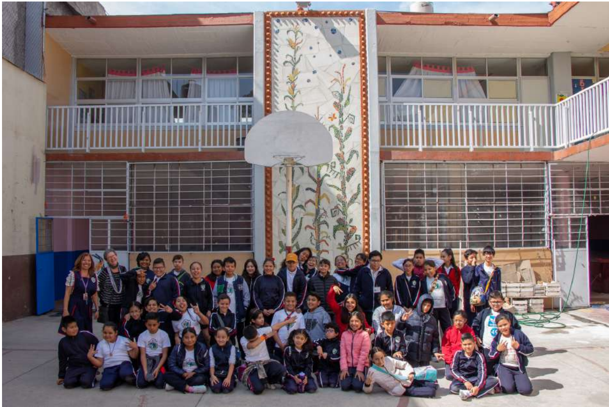
El mural de la milpa , Perla Krauze Mural at the República de Cuba Elementary School

This season culminated the production of El mural de la milpa that the artist Perla Krauze developed at the República de Cuba Elementary School in collaboration with one of the fourth-grade groups. The project started in September 2019 and ended with the installation of a permanent 14-square-meter rock, granite and tile mural.