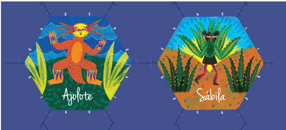
Characters from the board game: I Recreate the City