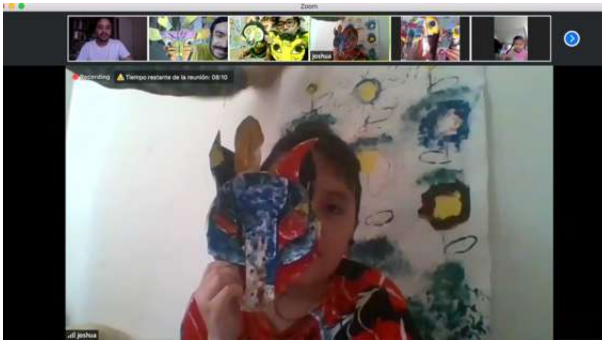
Homemade Animal Carnival, Online Mask Making Workshop

For Casa Gallina and its team, the first quarter of the year meant strengthening alliances with various institutions and local agents in Santa María la Ribera. Focusing on the relationship with public schools in the neighborhood, with whom the Producing and Recreating School: Models for Strengthening School Knowledge strategy was designed and implemented. It includes various educational programs on healthy eating, agriculture and environmental empathy. On the other hand, the program of permanent interventions of school premises carried out by artists in collaboration with each school's community was continued.