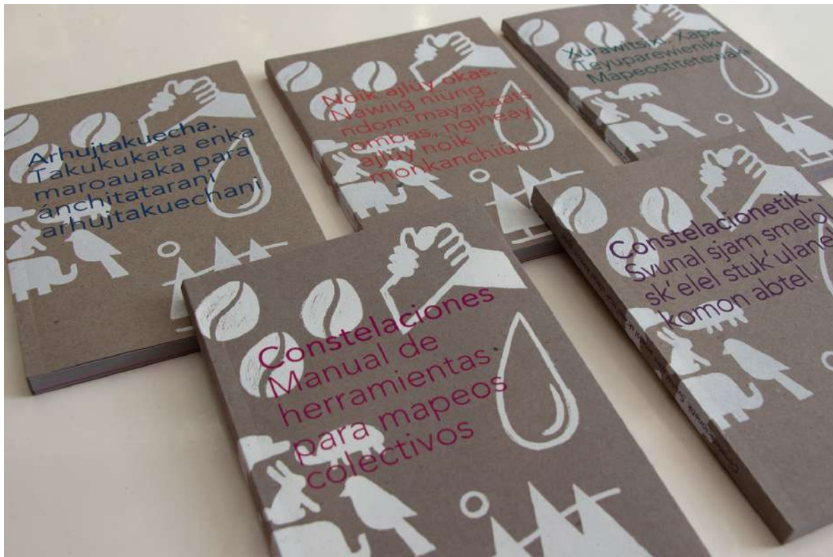
Constellations: A Manual for Collective Mapping

As part of the educational program, an area of Casa Gallina was adapted to host a children's library, called El nido (The Nest) This space is available for children to consult and borrow diverse educational materials on the environment. As part of the activations of this program, the Extraordinary Ecological Stories: The City and Origins and From the Cosmos to the Earth workshops were implemented.